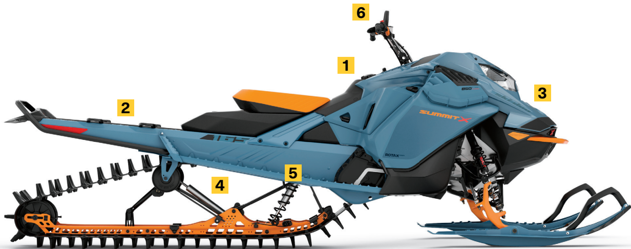
SUMMIT® X® 165 850 E-TEC® TURBO SHOWN

One-piece polypropylene construction instantly drops 6.2 lb of weight. Optimized ventilation for heat dispersion and noise reduction.