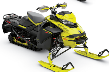
RENEGADE® X-RS® 850 E-TEC® SHOWN