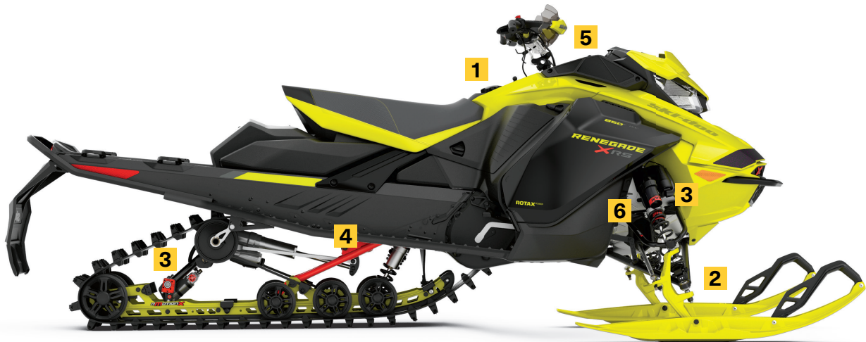
RENEGADE® X-RS® 850 E-TEC® SHOWN

An industry-first, Smart-Shox semi-active suspension instantly reads terrain and rider input to automatically dial in your suspension to give you the optimal ride in any conditions.