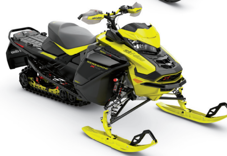
RENEGADE® X-RS® 900 ACE® TURBO R SHOWN