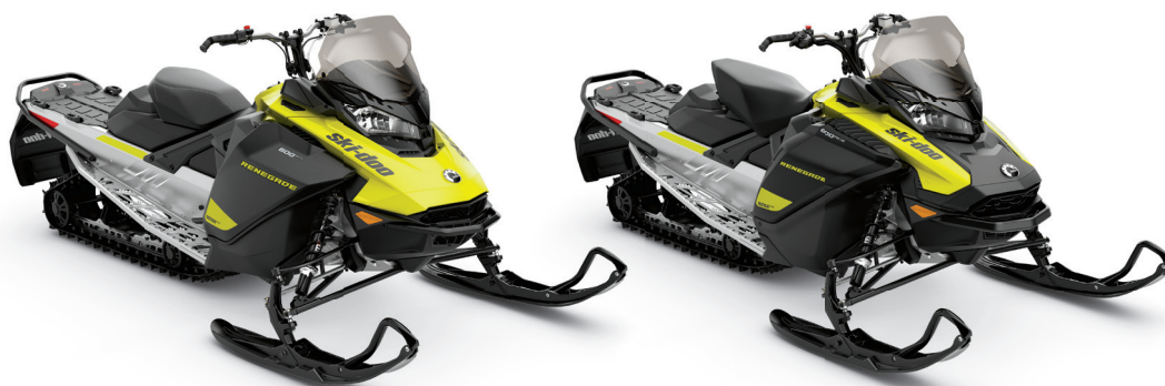
RENEGADE® SPORT 600 EFI SHOWN

Value-oriented with exceptional handling, bump capability and light off-trail riding.