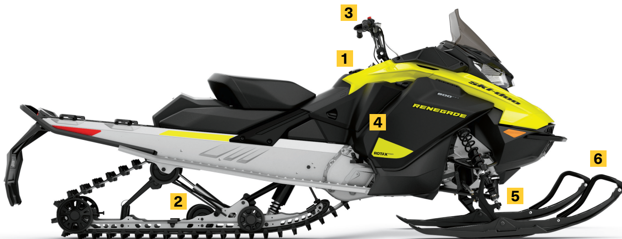
RENEGADE® SPORT 600 EFI SHOWN

Saves time and energy, adding immense value for the rider.