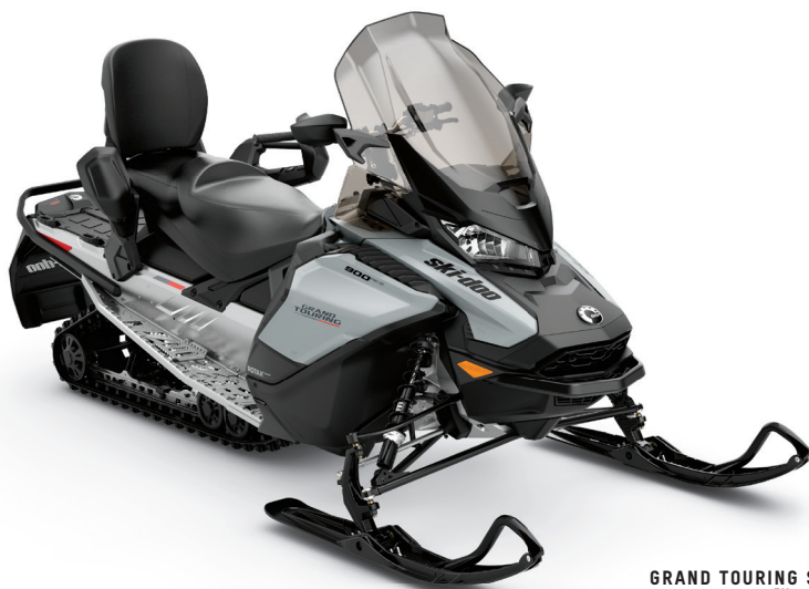
GRAND TOURING SPORT 900 ACE™ SHOWN

Trail comfort and 2-up features with precision handling and savvy style.