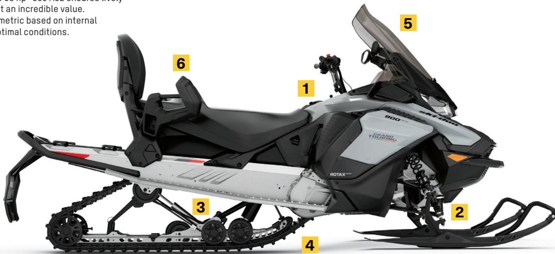
GRAND TOURING SPORT 900 ACE™ SHOWN

High-quality KYB high-pressure gas shock for excellent performance and reliability.