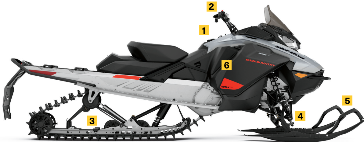
BACKCOUNTRY™ SPORT 146 600 EFI SHOWN

Saves time and energy, adding immense value for the rider.