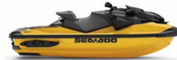
With sound system ● NEW Millenium Yellow