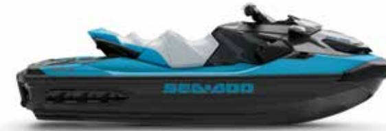
Beach Blue Metallic & Lava Gray (GTX 170 only)