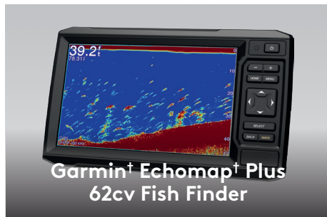
Garmin† Echomap† Plus 62cv Fish Finder

A top-of-the-line navigation, charting and fish-finding system using CHIRP technology for high definition images.