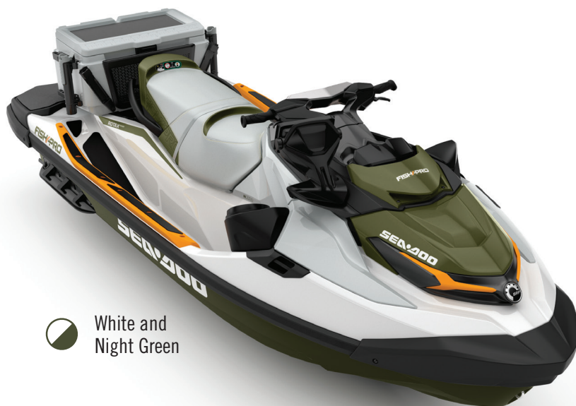
White and Night Green