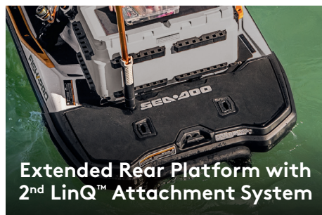
Extended Rear Platform with 2 nd LinQ™ Attachment System

A spacious, quick-attach fishing cooler designed for easy access and equipped with numerous convenient features.