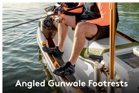
Angled Gunwale Footrests

Adds 11.5 inches to the back of the watercraft to increase stability, space, and storage capability.