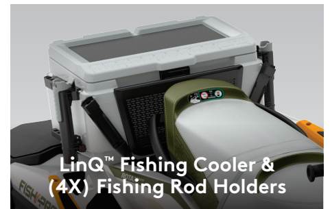
LinQ™ Fishing Cooler & (4X) Fishing Rod Holders

Optimized for ease of movement around the entire watercraft, and for better comfort and stability when facing sideways.