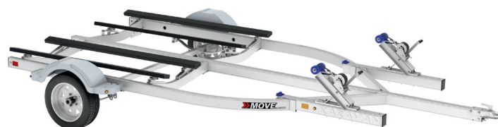
Aluminum MOVE II