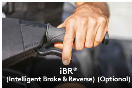
iBR® (Intelligent Brake & Reverse) (Optional)

This exclusive Sea-Doo® feature optimizes power output for up to 46% improved fuel efficiency.