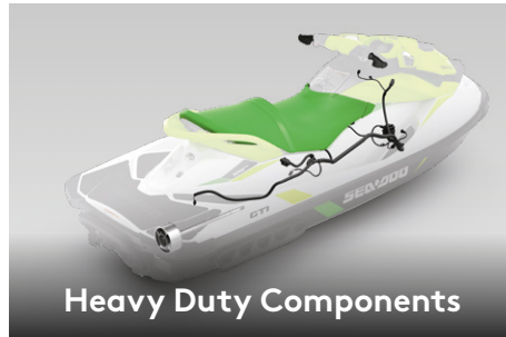
Heavy Duty Components

The Rotax® 1503 engine has been tested and proven to be incredibly reliable and fuel-efficient for more than a decade. 1