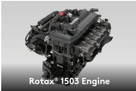
Rotax® 1503 Engine

The Rotax® 1503 engine has been tested and proven to be incredibly reliable and fuel-efficient for more than a decade. 1