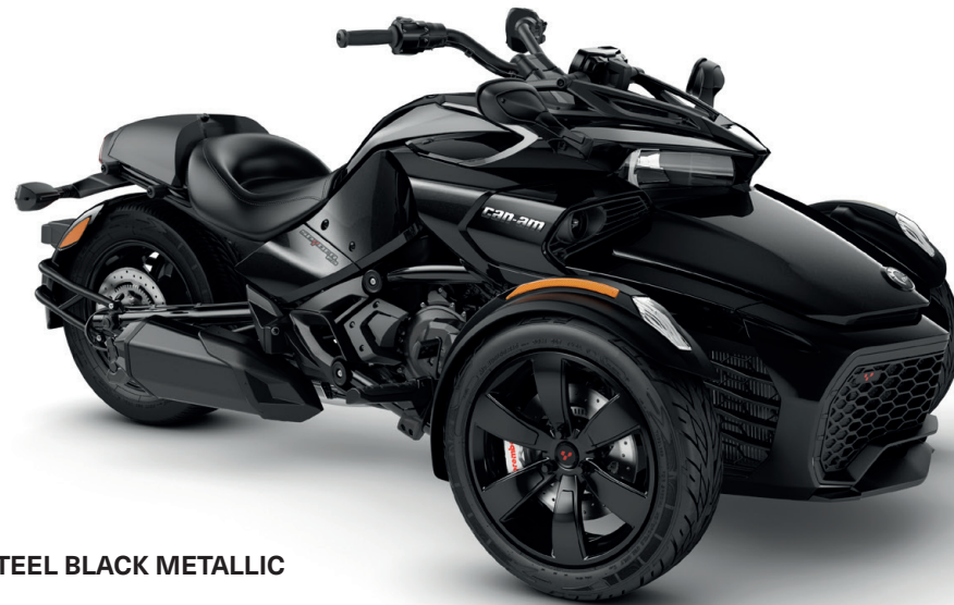
STEEL BLACK METALLIC