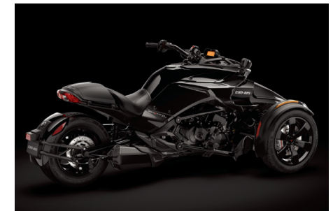
Y ARCHITECTURE Two wheels in front means better handling and enhanced stability.