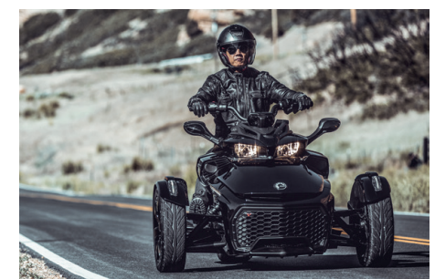
SEMI-AUTOMATIC TRANSMISSION Shift through gears easily with the touch of a button.