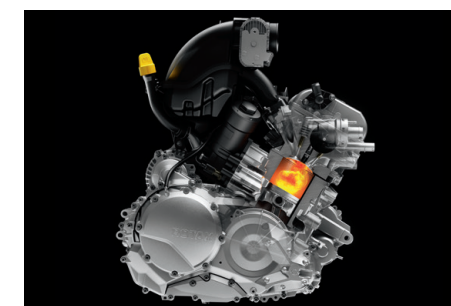
ROTAX 1330 ACE ENGINE 105 HP engine – Power meets efficiency. Hit the road knowing you've got a proven engine that will go the distance.