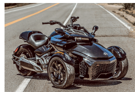
VSS Vehicle Stability System that uses a variety of technologies, including SCS / ABS / TCS, to monitor the vehicle and keep the rider confident on the road.