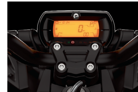
DIGITAL GAUGE 4.5" digital display with a minimalist design to see everything you need.